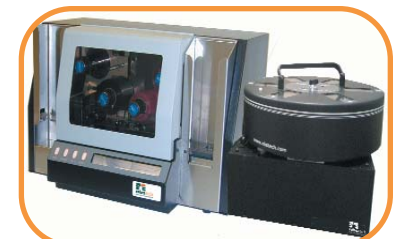
Optional 6-hopper carousel